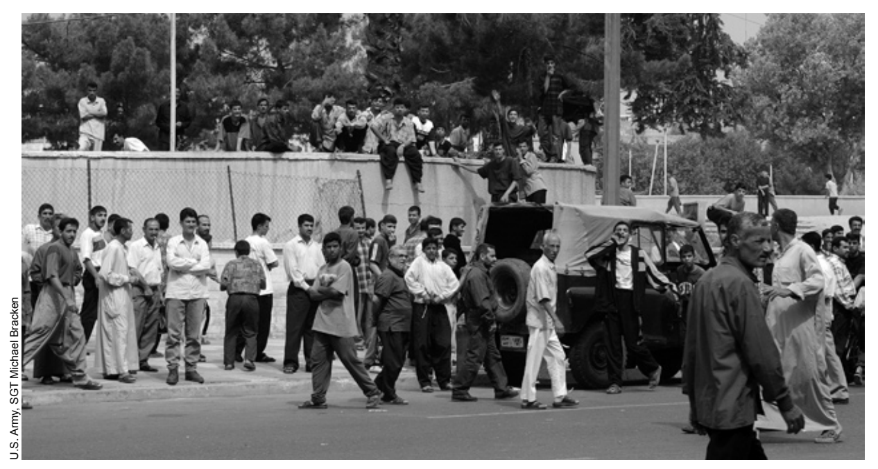
The new Iraqi identity? A surly crowd watches Soldiers take Iraqi males into custody for throwing bricks and instigating violence, in Mosul, Iraq, 13 June 2003.

presupposes that other peoples want to join us, and that given a sufficiently robust consumer culture and Western electoral norms, they would enthusiastically embrace America's world vision.