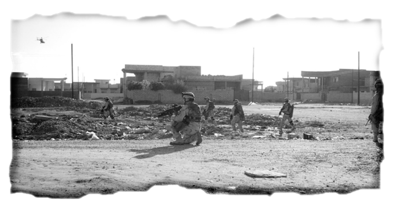
Fighting in the "place of the two rivers": U.S. Soldiers advance through the streets of Samarra during Operation Iraqi Freedom, 21 December 2003.

The views expressed in this article are entirely the author's.