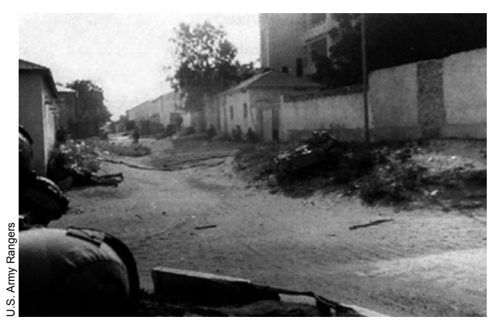
Members of Task Force Ranger under fire in Somalia, 3 October 1993, Operation Code Irene, the Battle of Mogadishu. Eighteen Soldiers were killed, and the U.S. withdrew from Somalia less than a week later.

is making Marines helpmates in the Sunni struggle against the Sh'ia other. This may be the only practical thing to do, but it is no longer COIN, because it no longer lives within the ruling concept of control: that at some irresistible, string-pulling level, we are in charge. Rather, improvisation in Anbar may be the first glimmer of a new strategic path: toward a doctrine of cooptation over counterinsurgency. It is also a sign that the era of control is over.